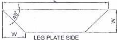
LEG PLATE SIDE PLATES (SIDE LIMBS "A")

DIVISION: ELECTRICAL SHEET NO.: DRG NO.: MATL: AS PER: FINISH: DEP. #