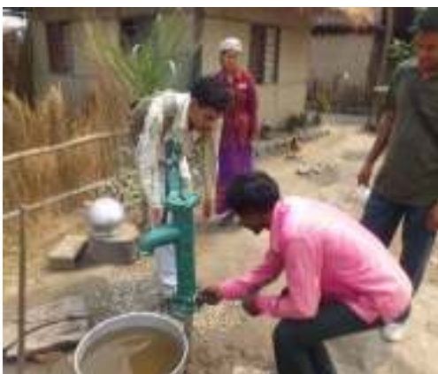
Providing safe drinking water